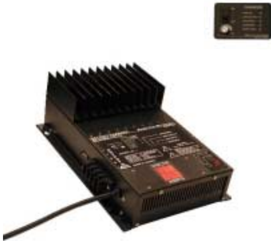
(Shown with Optional Digital Meter)